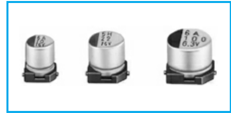
Marking color : Black print